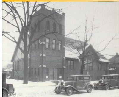
The Rose Street Church of God was constructed in 1920.

Celebrating 125 Years and Counting September 18, 2011